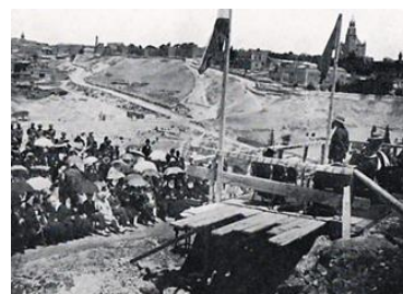
Lord Allenby speaking at the laying of the Foundation Stone 7 th May 1927

major Scottish formation was the 52nd Lowland Division, a Territorial Force, which fought from Egypt to Tel Arsuf, north of Jaffa from April 1916 until April 1918, but there were many other Scots besides. The foundation stone was laid by their commander, Field Marshal Sir Edmund Allenby in 1927.